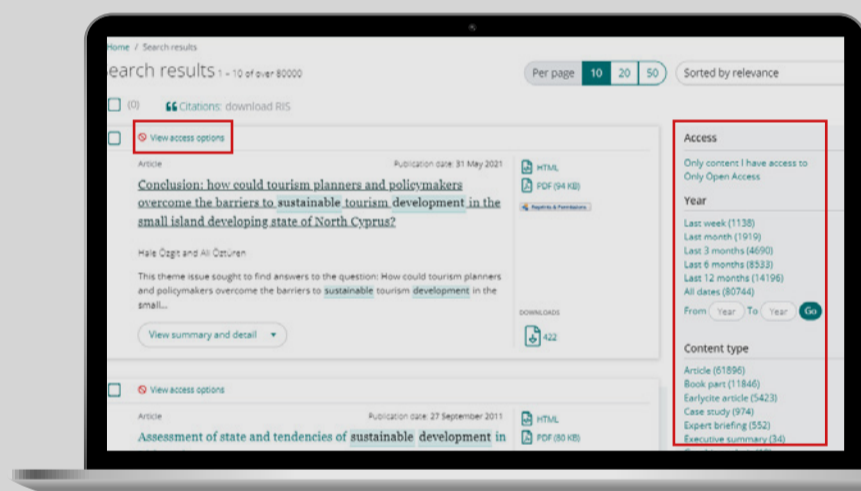
Example search result page

From the browse area or the search results page, you can apply content filters such as type, date and subject. You can also limit results to display available content by selecting the 'Only content I have access to' link.