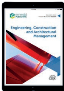
Engineering Construction and Architectural Management