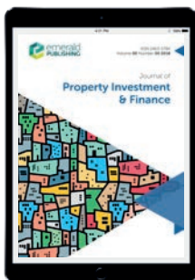
Journal of Property Investment & Finance