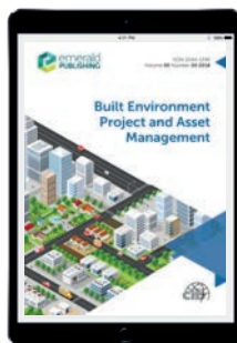
Built Environment Project and Asset Management