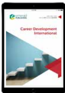
Career Development International