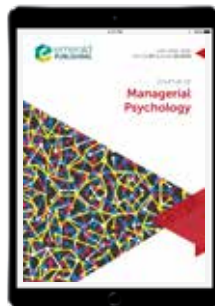
Journal of Managerial Psychology