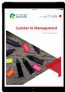
Gender in Management